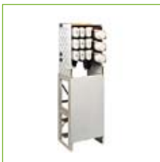
Magnefix 3,6 - 15 kV

The medium voltage switchgear systems carrying Eaton's Holec brand are based on the use of vacuum switches combined with solid insulation material. This is an environmentally-friendly technology in comparison with the methods used by many other suppliers, which use SF 6 as an insulation gas.