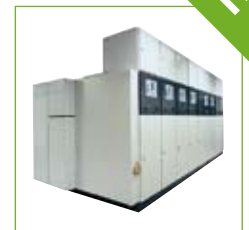
MMS 3,6 - 24 kV

Metal-enclosed air insulated motor control centre and single busbar main distribution system.