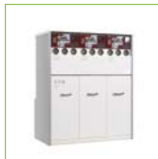
Xiria 3,6 - 24 kV

Epoxy resin insulated Ring Main Units for energy distribution.