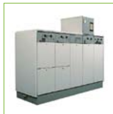
SVS 3,6 - 24 kV

Metal-enclosed epoxy resin insulated Ring Main Units for energy distribution and industry.